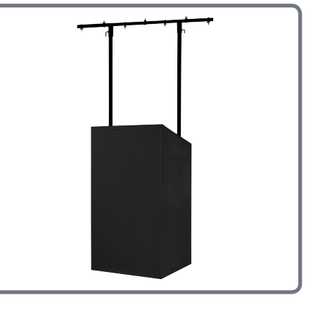
Optional Black Lycra Order code: EQLED014D

Optional Black Starcloth with tri-colour LEDs and controller Order code: EQLED014C